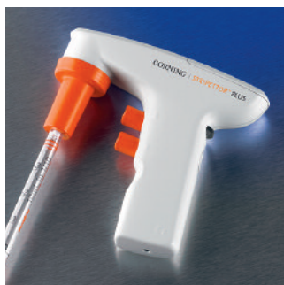
Stripettor Plus Pipetting Controller with pipet