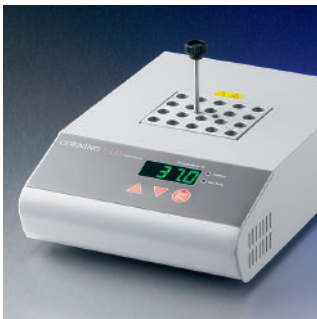
Single Block Digital Dry Bath Heater