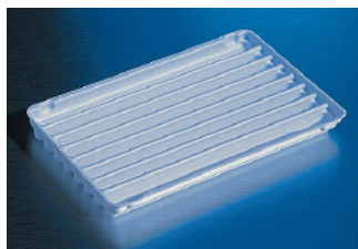
Transtar Disposable Cartridge