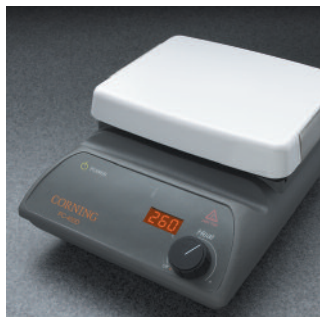
Model PC-400D shown