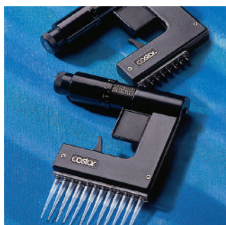
8- and 12-Pette Multichannel Pipettors