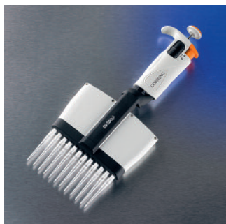
Lambda Plus 12-Channel Pipettor