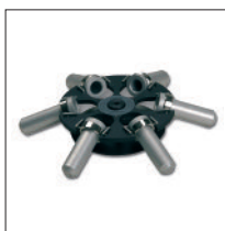
480138 6 x 5 mL Swing-Out Rotor