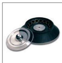
480139 18 x 1.5 mL Fixed Angle Rotor