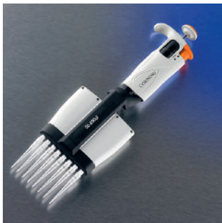
Lambda Plus 8-Channel Pipettor