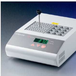
Double Block Digital Dry Bath Heater