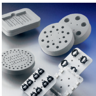
Accessory Heads for LSE Vortex Mixer