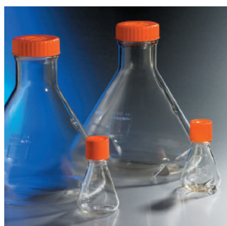
Polycarbonate Erlenmeyer Flasks, Baffled

For a full listing of Corning flasks, please visit www.corning.com/lifesciences .