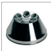
480136 6 x 50 mL Fixed Angle Rotor