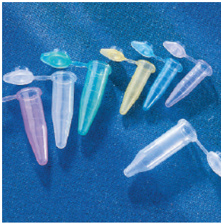
Snap Cap Polypropylene Microcentrifuge Tubes