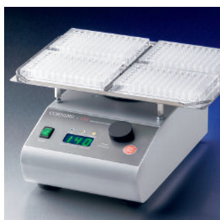
Digital Microplate Shaker