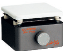
Scholar 170 Hot Plate

Note: 230 volt 6796 hot plate/stirrer comes with UK plug.