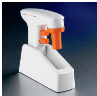
Stripettor Plus Pipetting Controller in charging position