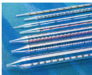
Stripette Serological Pipets