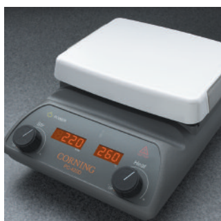
Model PC-420D shown