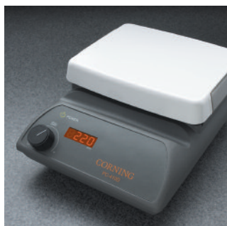
Model PC-410D shown