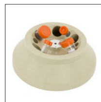
480143 15 x 50 mL Combination Rotor