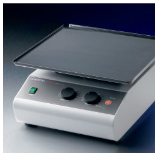
Low Speed Orbital Shaker