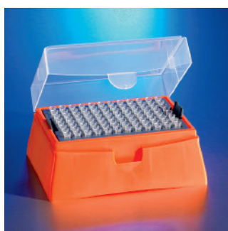
Low Binding Hinged Rack Barrier Pipet Tips

*The unique design of this patented extended-length tip allows standardization across a wide range of 20 µL, 50 µL, 100 µL and 200 µL pipettors.