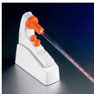
Stripettor Plus Pipetting Controller in storage position