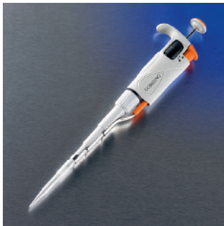
Lambda Plus Single-Channel Pipettor