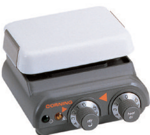
Corning PC-220 Hot Plate/Stirrer