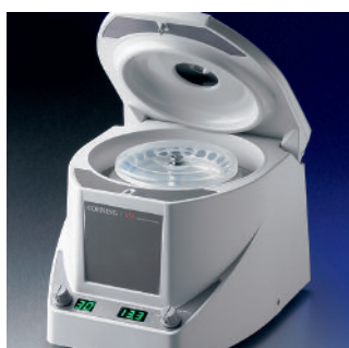
High Speed Microcentrifuge