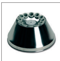
480137 12 x 15 mL Fixed Angle Rotor