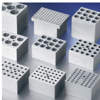
Digital Dry Bath Heater Accessories