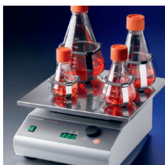
Orbital Shaker with options clamps and flasks