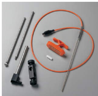
Hot Plate Accessories