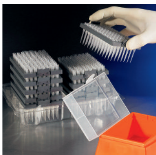
Remove deck from reload system.

Corning® DeckWorks reload systems are available in 10 µL, 200 µL, 300 µL and 1000 µL sizes and allow for convenient and economical reloading of durable Corning DeckWorks hinged racks. DeckWorks reload decks are packaged in transparent trays for easy tip identification, require no transfer devices, save space and minimize packaging waste. Although the pipet tips are made from virgin medical-grade resins, the reload decks and rack bases are manufactured from 100% recycled polypropylene. Nonsterile decks and racks are steam autoclavable.