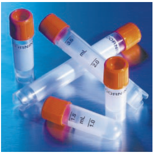
External Thread Cryogenic Vials

Appropriate safety equipment (gloves, face shields, biological safety cabinets, hoods, etc.) should always be used to protect personnel when removing vials or ampules from cryogenic storage systems.