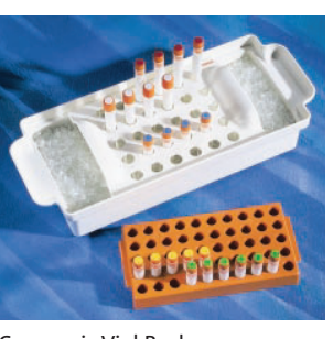
Cryogenic Vial Racks