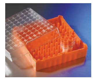
431121 Cryogenic Storage Box