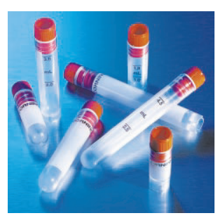
Internal Thread Cryogenic Vials