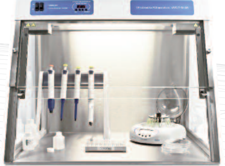
UVC/T-M-AR - stainless steel UV cabinet