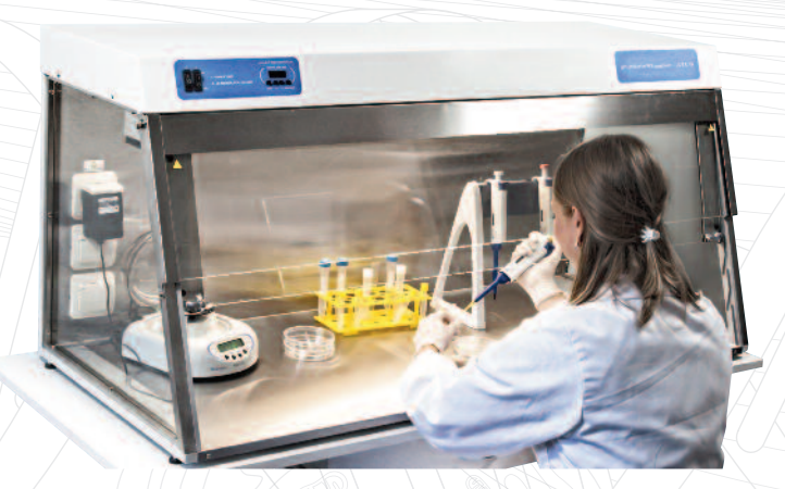
UVT-S-AR - double PCR workstation