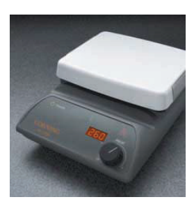
Model PC-400D shown