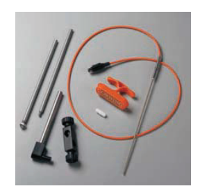
Digital Hot Plate Accessories