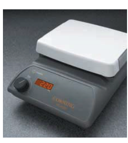
Model PC-410D shown