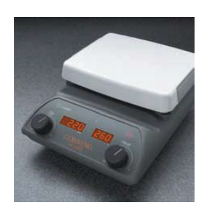
Model PC-420D shown