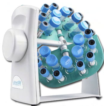
Revolver with H5600-15 Rotisserie