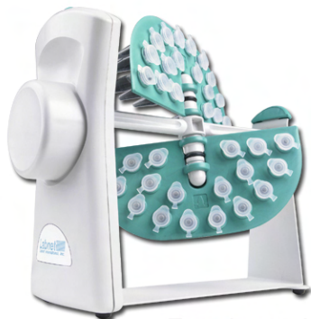
Revolver with Standard Rotisserie

With a molded housing and unique rotisserie design, the Revolver is easy to clean and decontaminate. A 36 x 1.5/2.0 ml rotisserie is supplied with the Revolver. Other configurations are available separately.